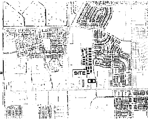
VICINITY MAP SCALE 1:2,000'-0"

1309 S. Colorado Blvd. Penthouse Denver, Colorado 80222 (303) 303-1180 ext 000 (303) 303-1180 ext 000 (303) 303-1180 ext 000 www.maharch.com