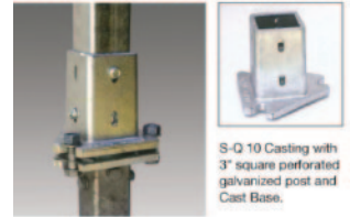
S-Q 10 Casting with 3" square perforated galvanized post and Cast Base.